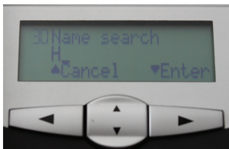
Mitel - Aastra 6731i