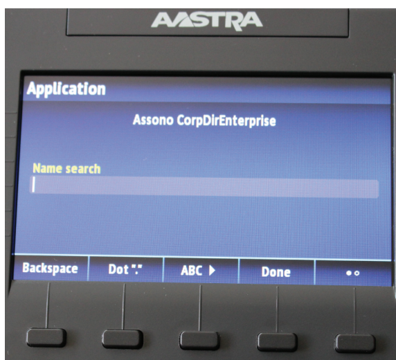
Mitel - Aastra 6869i